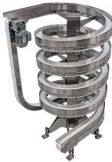
Carryline spiral S530 Type F -up ↗.