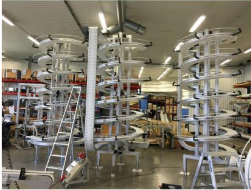
Carryline spirals S220 Type D -up ↗.